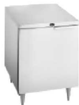
Model 9404-7 / 9404F-7

I# CP34-02-0048 -- Undercounter Refrigerator, 27"L, 30"D, 1-section, 27" door, s/s top, front & sides, 6" legs, rear-mounted self-contained refrigeration system, 1/4 HP